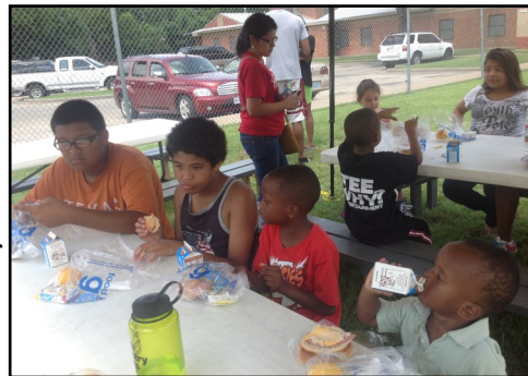
Top: Children at Kate Ross enjoy free summer lunches. Bottom: Mothers take notes and have a discussion at a “Cooking Matters” class.

WRBA exists to lift up the work of churches that are voluntarily affiliated. When we have this kind of interest in fellowship, God moves in mighty ways. I think God loves us worshipping Him publicly, especially in a place as unlikely as a public housing complex! “Hunger in God’s World” takes place every Friday until Aug. 8. Call 644-6933 to join. We’d love to hear how you collaborate with others in your hunger ministry.