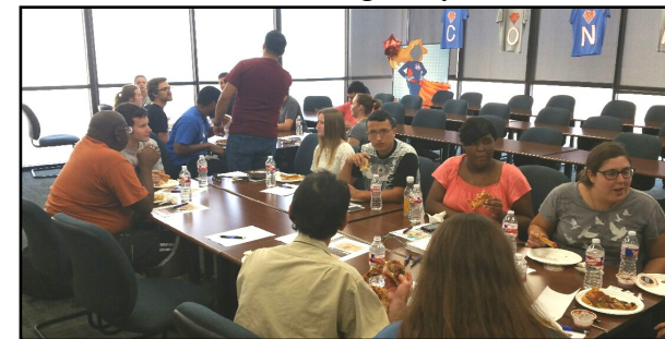
MCC students enjoy the first free lunch of the semester, courtesy of WRBA churches and collegiate ministry team.

The semester is off to a great start at McLennan Community College. The Baptist Student Ministry has been growing and producing fruit. We started the school year with an outreach in the middle of campus where students were able to tell other students about Christ and connect with each other to form community. We have also started our free lunches every Wednesday. This is a time where local churches provide and serve meals to the students, showing Christ's love to them. So far we've had more than 100 students connect with us this semester and more than 20 that regularly attend events.