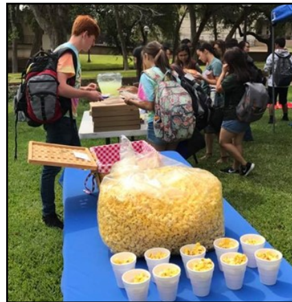
Students lining up for pizza at the first BSM kickoff event at MCC.