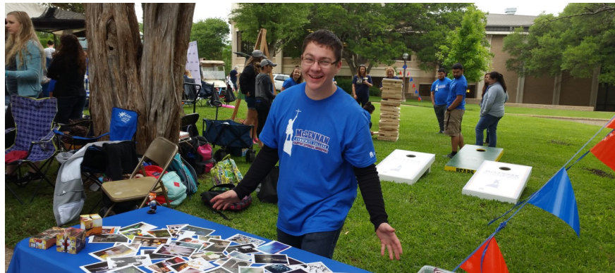
WRBA has helped several local churches partner with MCC students and start a BSM. Above: One student welcomes others to the BSM table at the Highlander Games. Bottom left: BSM students pose with new game boards. Bottom right: MCC students play with full-sized Jenga set.