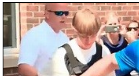
A picture of tragedy - Dylann Roof.