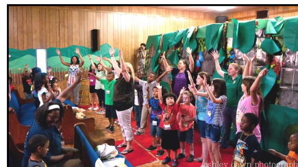
Vision of hope, VBS.