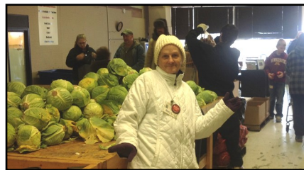
Top: A volunteer points out fresh produce. Bottom: Shepherd's Heart shelves quickly empty.