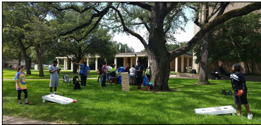
Student gather and play games at a BSM outreach event at MCC.