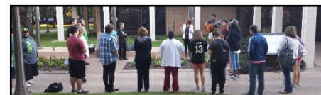
Students gather for See You At The Pole.